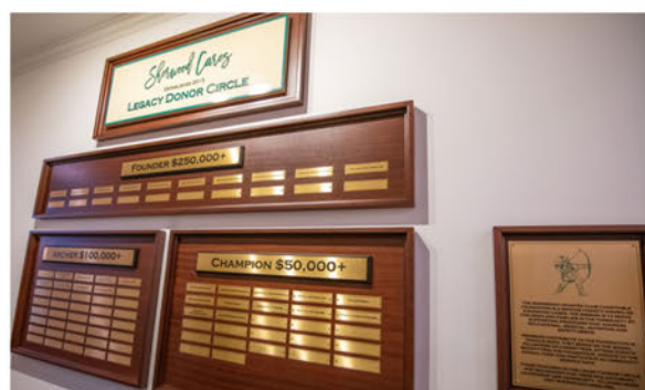
Sherwood Cares Recognition Wall